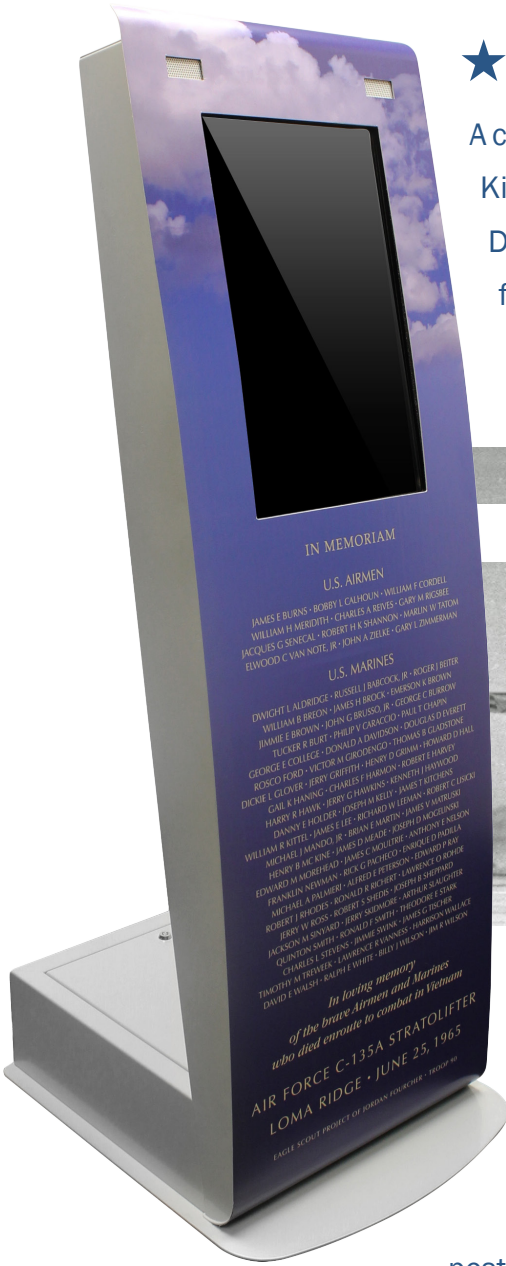
An Air Force C-135

A ceremony recognizing the 50th Anniversary and an unveiling of the Memorial Kiosk is planned for Saturday, June 27th starting at 1 p.m. There will be Distinguished Speakers, Marine Honor Guard and a Missing Man formation fly over with WWII aircraft. This ceremony is open to the public and will include some families of the fallen and veterans who served with service members on the flight.