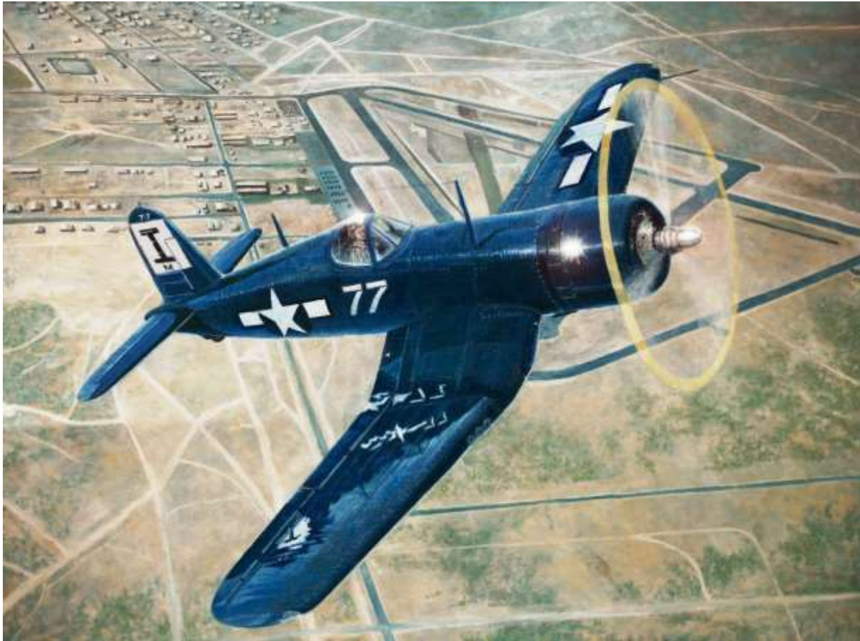
F4U Corsair over MCAS Mojave painting by Douglas Castleman

corrected the trouble with the aircraft flipping over onto its back. Captain Shaw had 164 hours in Corsairs during the last three months with a total of 1146 hours in the type. The total time on Corsair #17936 was 551 hours.