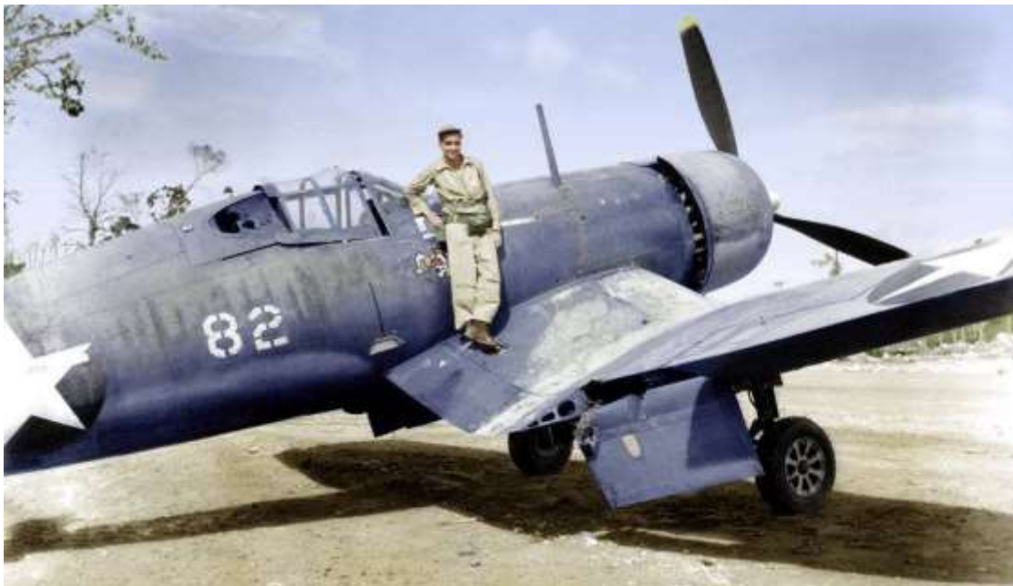
2Lt Harry S Huidekoper of VMF-213 poses aboard F4U-1 Corsair at Munda Airstrip, New Georgia, Solomon Islands, Sept 1943.

By the end of VMF-213's third combat tour, another 35 Japanese planes were shot down, bringing the total of Japanese planes shot down to 104 for the Hell Hawks' three combat tours. Japanese aircraft were shot down at a rate of over 12 to 1. The squadron had seven aces during the three combat tours. Shaw added to his tally and was made a double ace with a total of 13 enemy planes shot down. Eight more pilots were also lost from his squadron during this time.