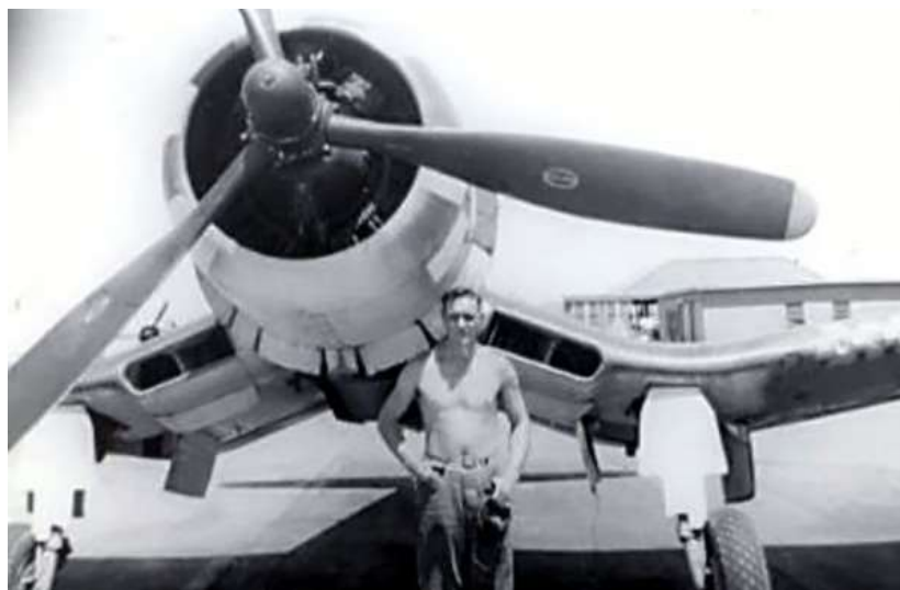
VMF 124 Corsair and mechanic at MCAS Mojave

MCAS Mojave became one of the main training centers for Marine squadrons slated for assignment aboard aircraft carriers. The squadrons at MCAS Mojave flew all the Corsair variants including the F4U, FG, and F3A versions. Mojave was an excellent training facility. The desert location provided VFR flying conditions most of the time, non-congested airspace, and nearby bombing and gunnery ranges. VMF-213's stateside training at MCAS Mojave was rigorous. Squadron training included division tactics, navigation, bombing, gunnery and field carrier landing practice. Pilot training consisted of test hops, night flying, cross country, navigational hops, and a lot of ground support missions with the 5th Marines at Camp Pendleton. During June 1944, they set a new daily record for Marine West Coast fighter squadrons by flying 272.2 hours with the squadron's 21 Corsair aircraft, which averaged 13 hours each.