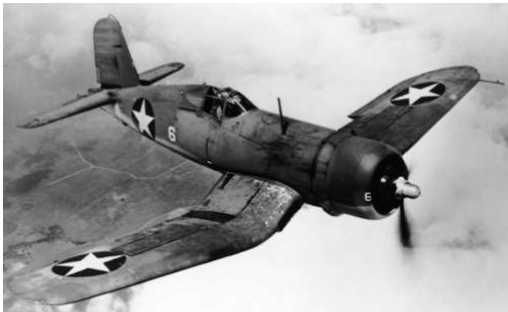
Vought F4U-1 Corsair January 1943