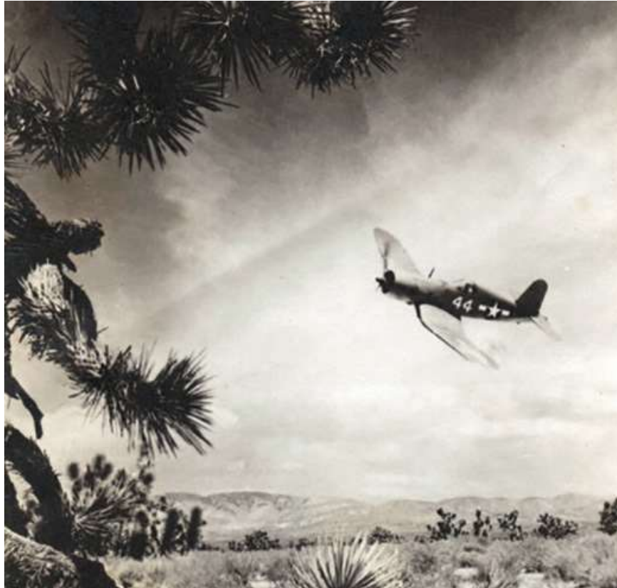
Corsair coming into MCAS Mojave December 1944

Training at MCAS Mojave was not without costs. There were at least 144 Corsair training accidents related to MCAS Mojave during WWII. The Corsair accidents are broken down as follows: 65 FG-1 accidents, 63 F4U-1 accidents, and 16 F3A accidents all from Corsair aircraft assigned to MCAS Mojave.