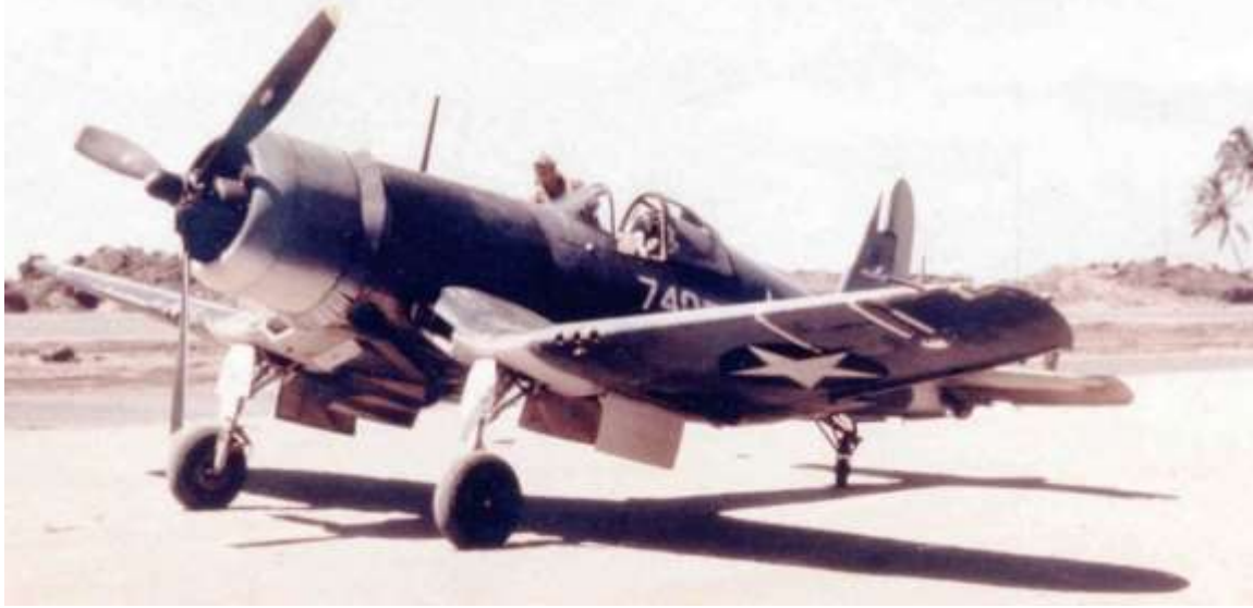
Marine F4U-1 Corsair on the Torokina Airstrip, Bougainville, Solomon Islands, early 1943.