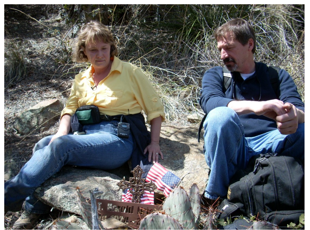
Family members placing memorial near the crash site, photo by Dave Trojan