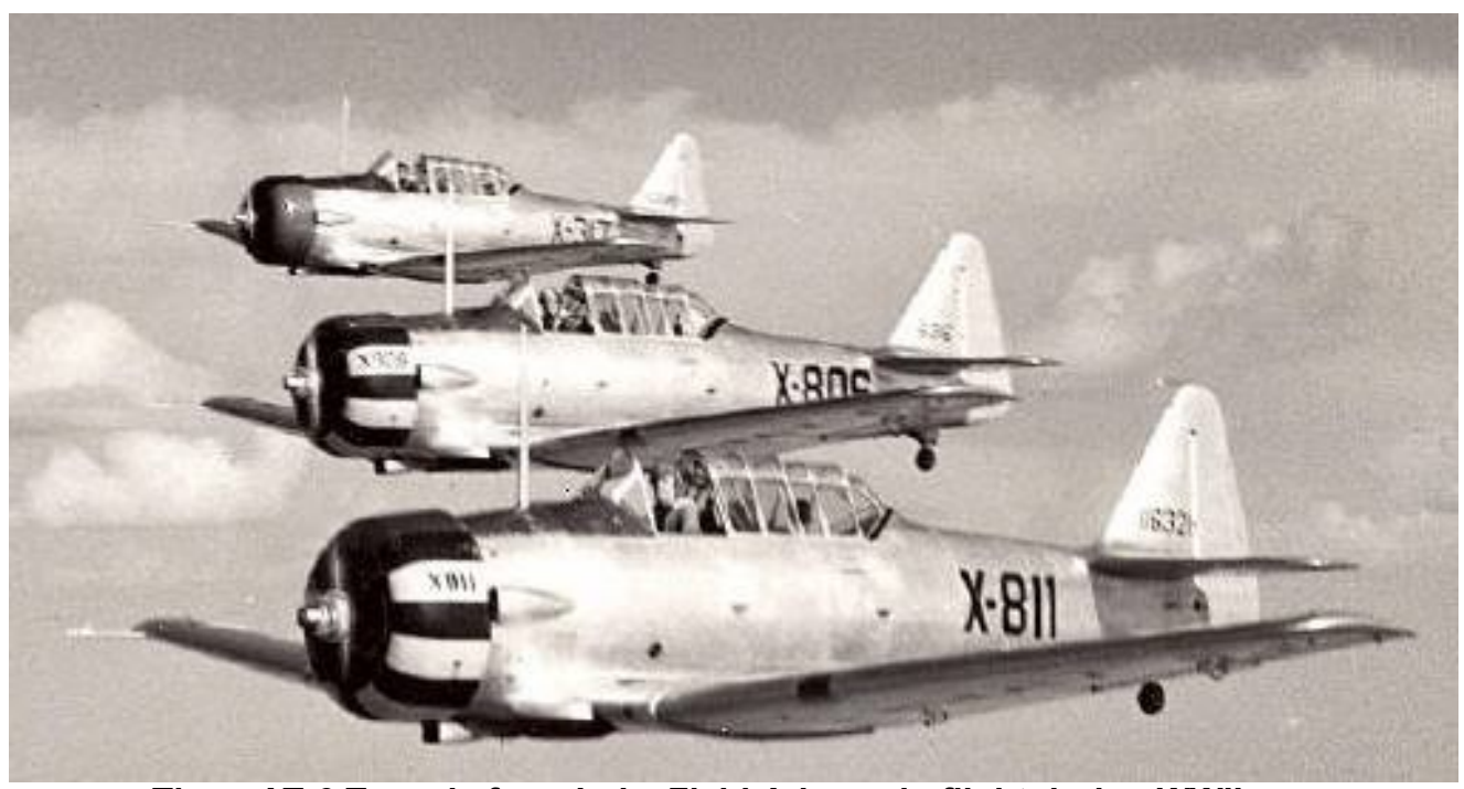
Three AT-6 Texan's from Luke Field Arizona in flight during WWII