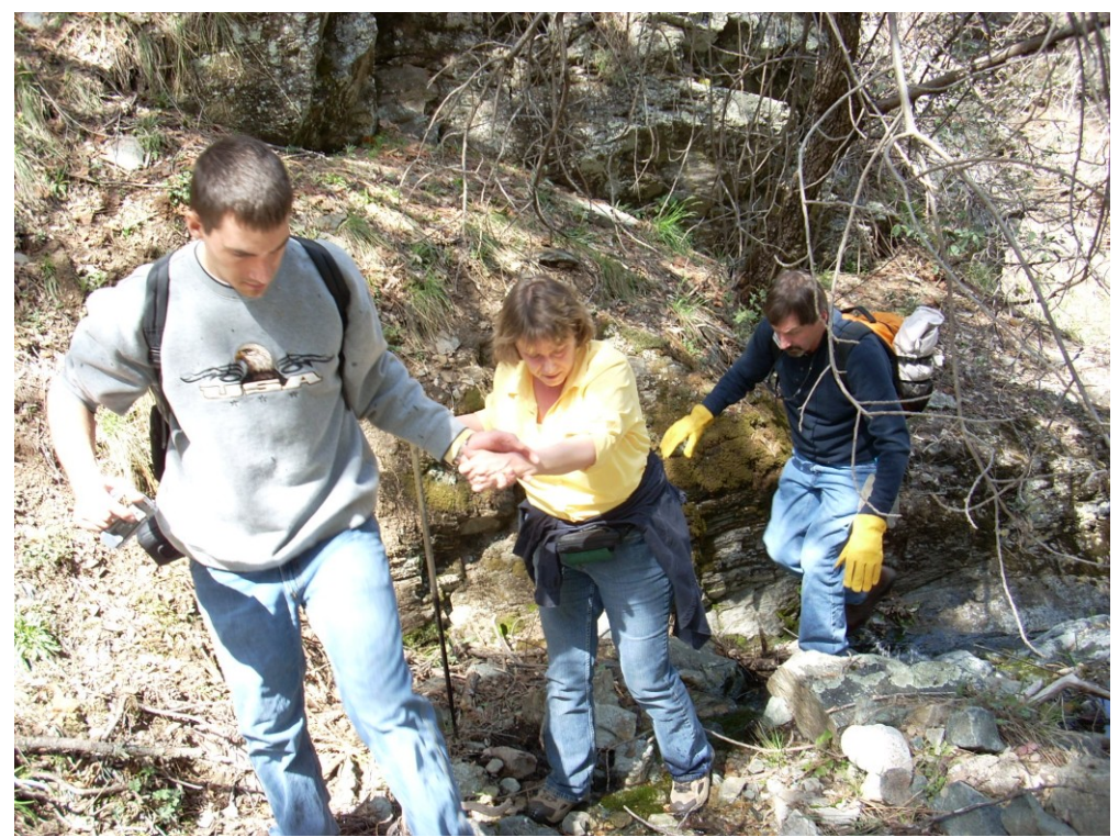
Hiking to the crash site