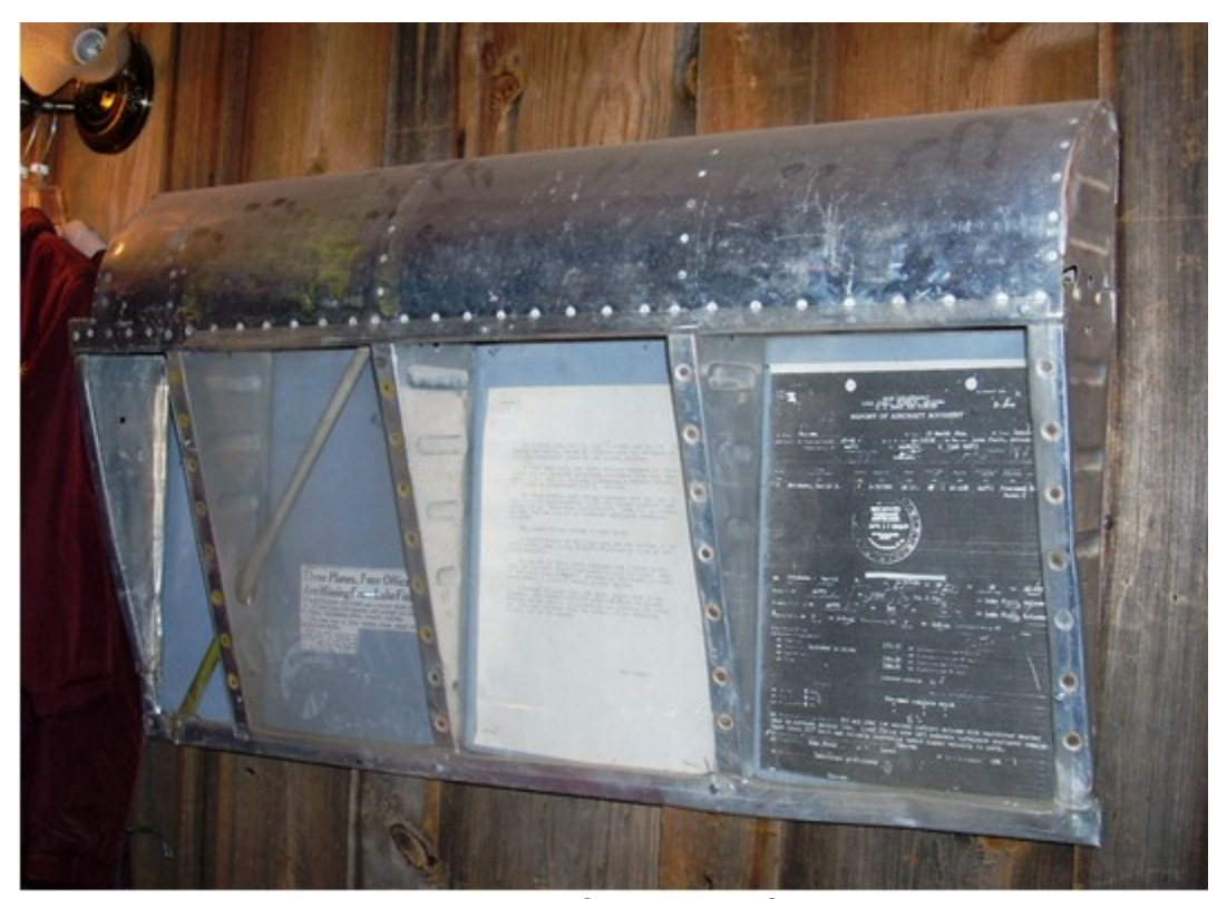
Memorial to the lost crews made from one of the planes is on display at the Crown King General Store

If you ever visit the town of Crown King, be sure to stop in at the general store and look in the back room. A piece of one of the AT-6s is mounted on the wall as a memorial reminder to the lost crews.