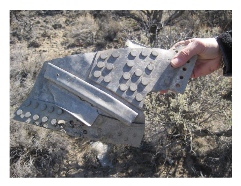
Several layers of riveted aluminum