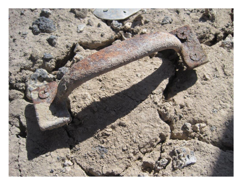
Handle from the interior of the aircraft