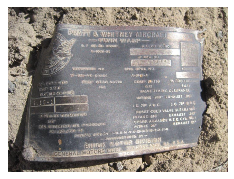
Data plate from a Pratt & Whitney R-1830 radial engine