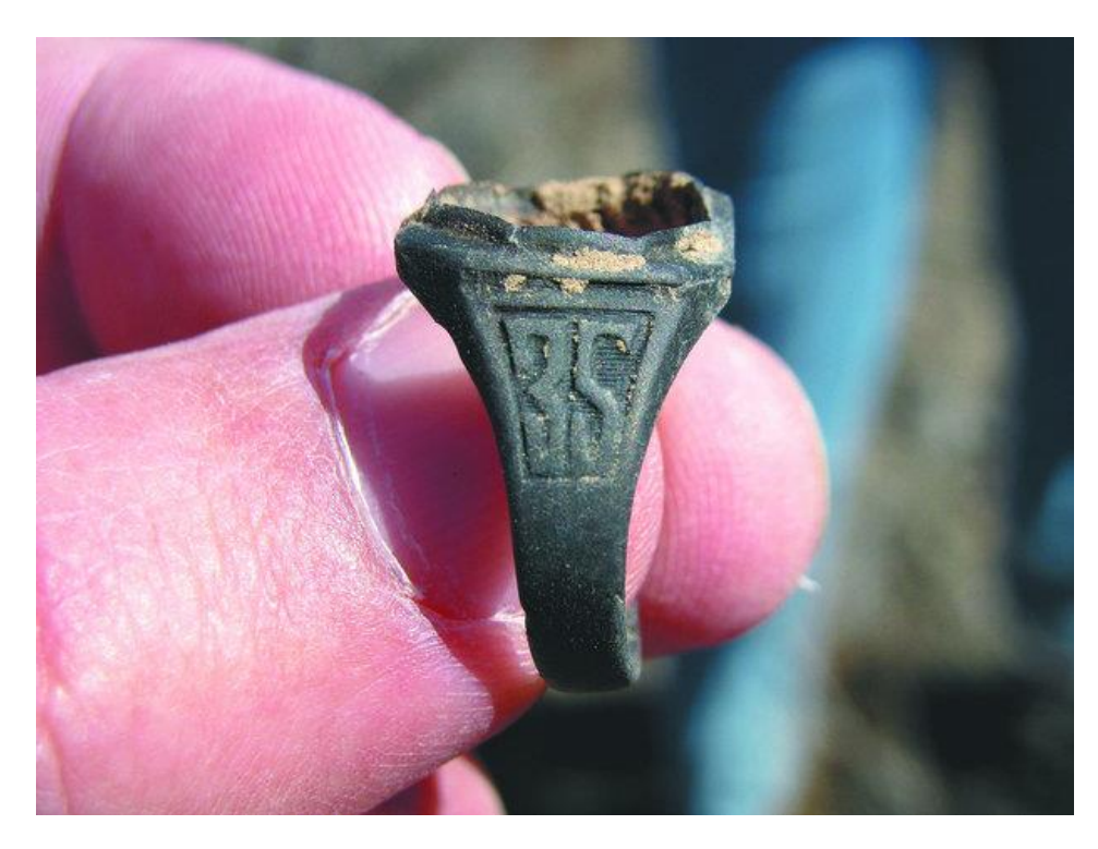
The 1935 high school class ring that was found at the crash site