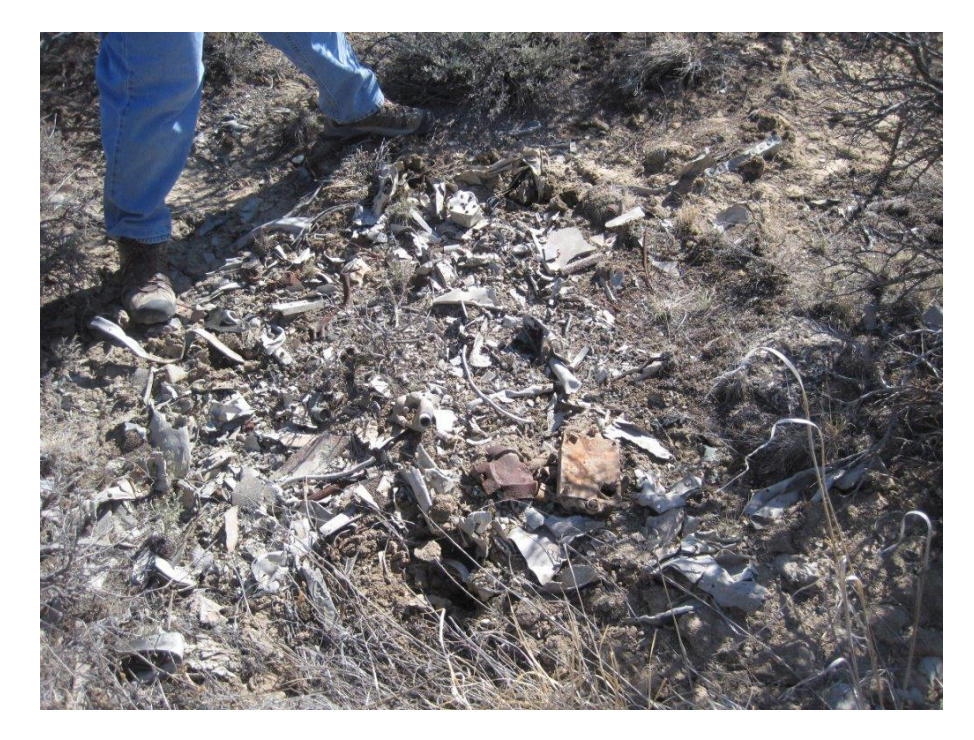
Part of the debris field at the impact site